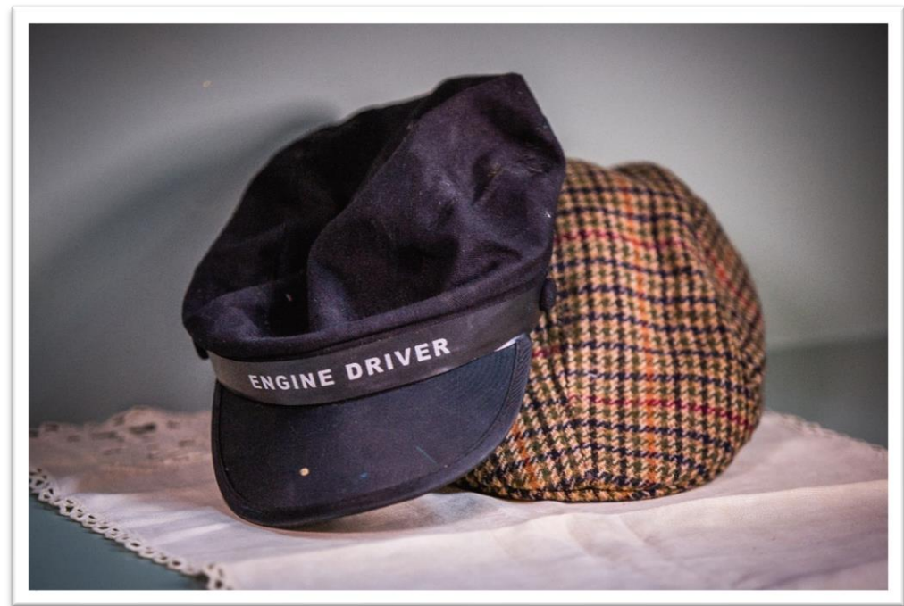
Figure 1: Engine driver hat.

'The most unusual job I've ever had was....'