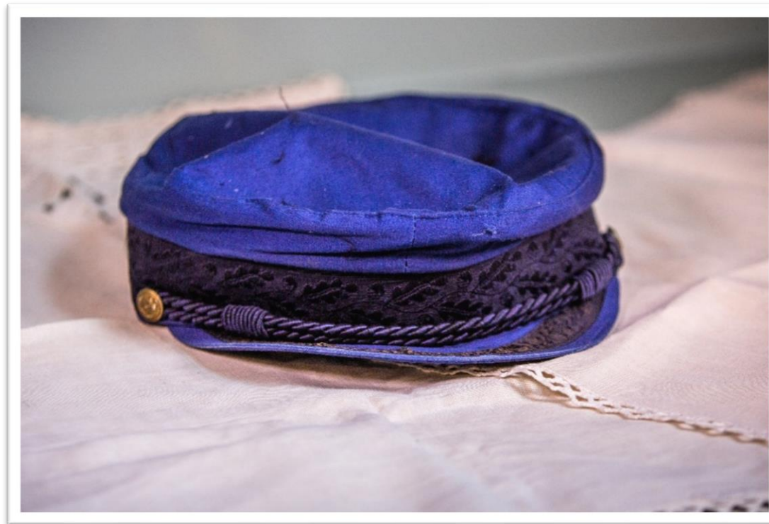
Figure 2: Blue work cap.