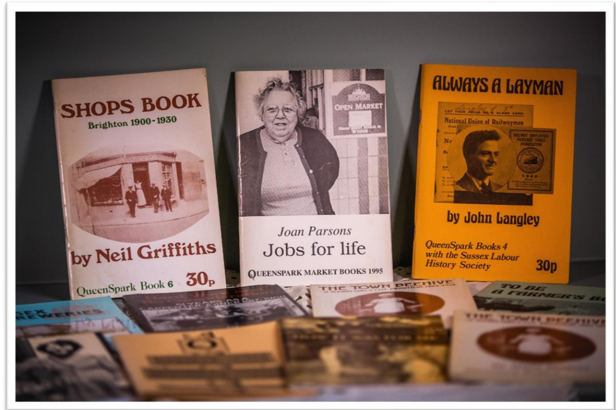
Figure 4: Selection of books on jobs and the workplace.