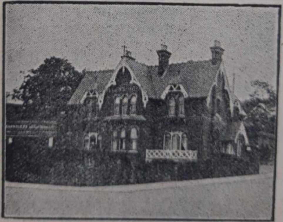
ST HELEN'S HOTEL, HASTINGS.