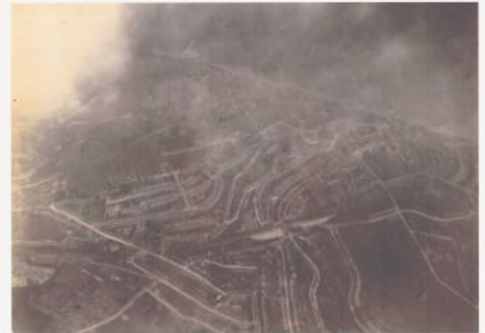
The aerial photograph, believed to be taken from a balloon in 1900, shows St Helen's Road and Park Road running either side of Alexandra Park, just right of centre at the bottom. Christ Church would be just below the centre bottom edge. The image captures all the built up parts of the town at that time