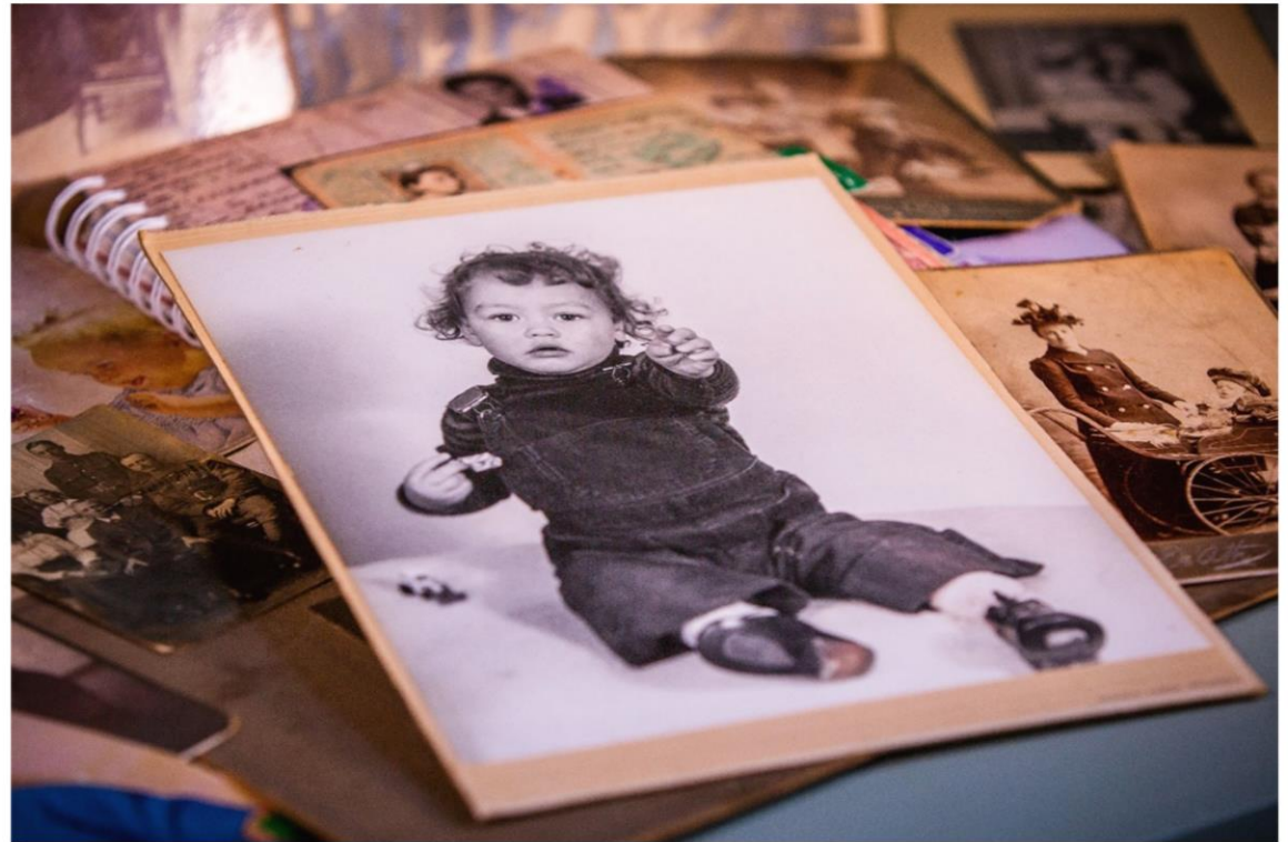
Figure 4: Photo of a child.