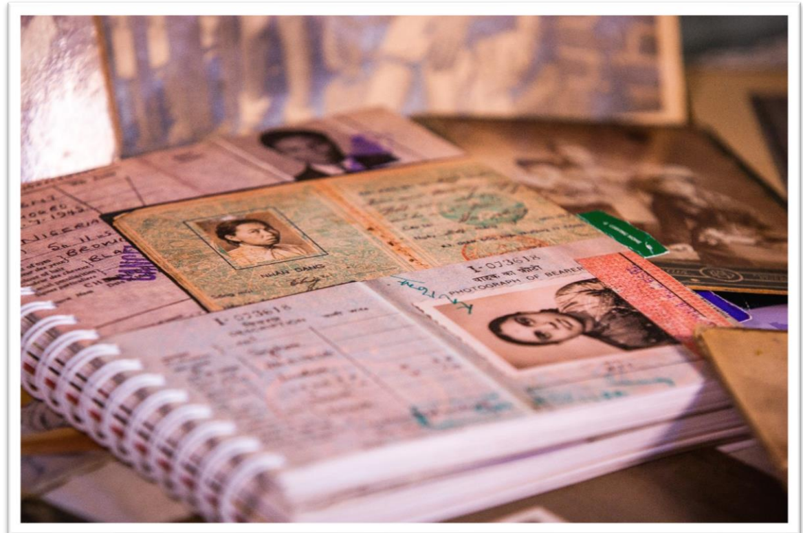
Figure 2: Family documents.