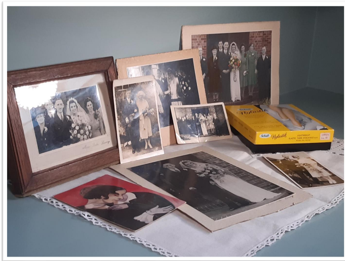
Figure 5: Family photographs.