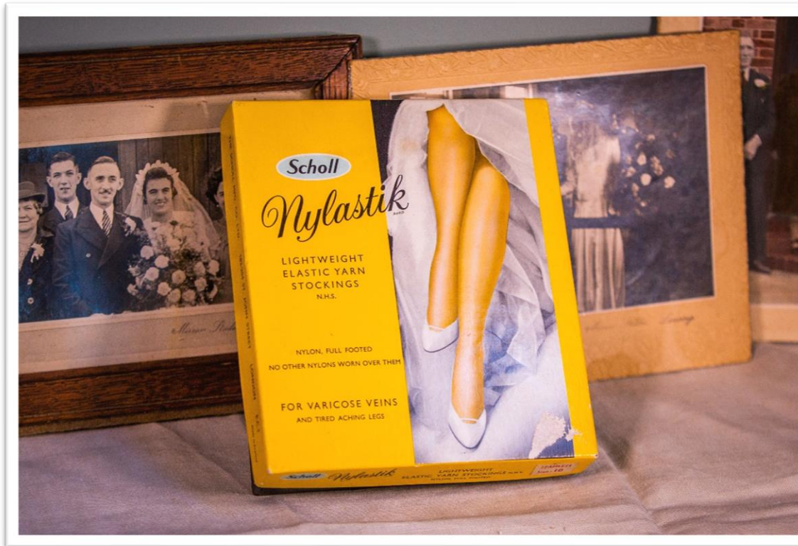
Figure 4: Box of Nylastik stockings.