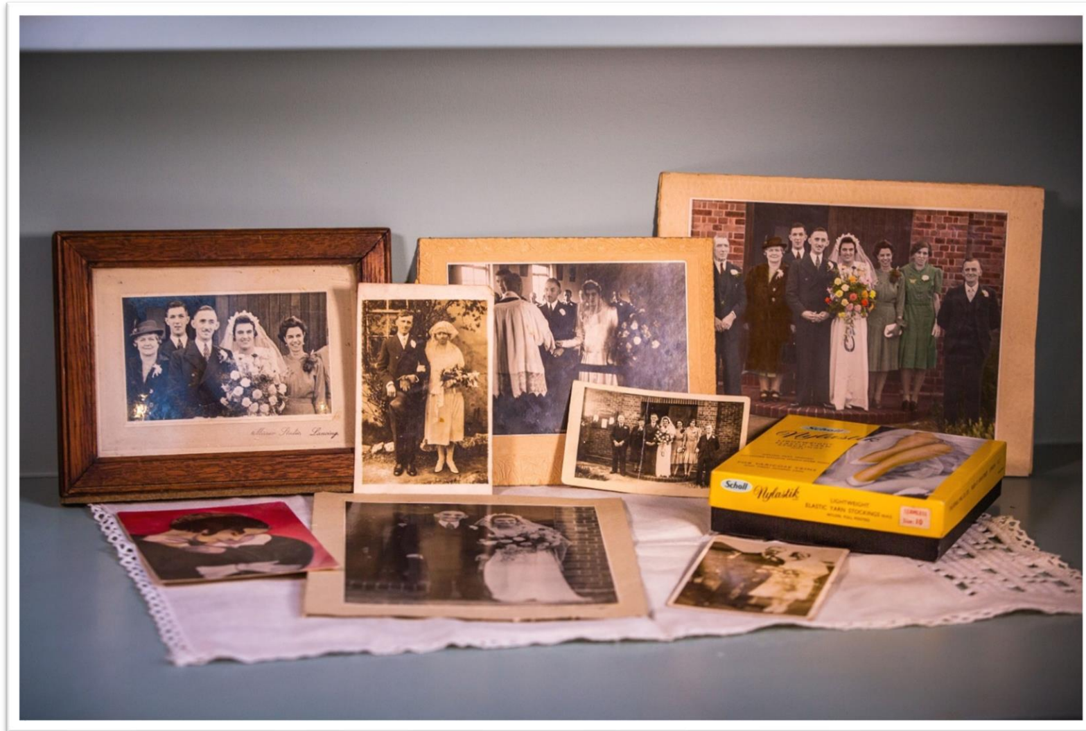
Figure 13: Family weddings