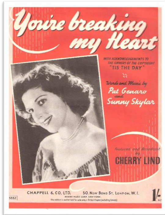
Figure 1: 'You're breaking my heart' song sheet from 1940s. Copyright free.

This section is all about love, marriage and courtship. Why not have a look through this resource further and pick ideas to support activities with friends, family and in groups too.