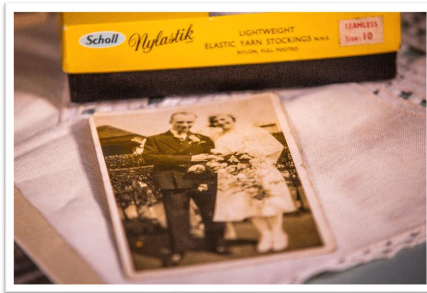
Figure 12: Wedding photograph.